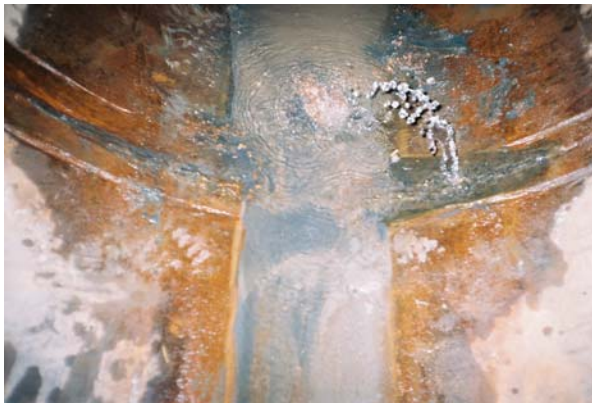
Figure 1. Leak inside Pipe from Ground Water

Infrastructure is the basic physical systems of a country's or community's population, including roads, utilities, water, sewage, etc. These systems are considered essential for enabling productivity in the country’s economy. Current trends in Forensic Engineering investigations of infrastructure items are applied to confirm fitness-for- service of components that have reached or exceeded the original design life or need to remain safely in-service. The fundamental NDT method used is visual examination. Removal or paint, coverings and debris that prohibit examination and access to the part are a requirement. Figures 1 and 2.