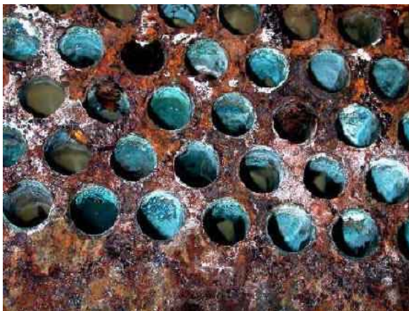
Figure 4. Heat Exchanger Tubes