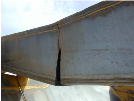
Figure 2. Failed Beam