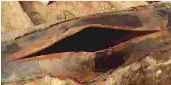
Figure 5. Ruptured Copper Pipe