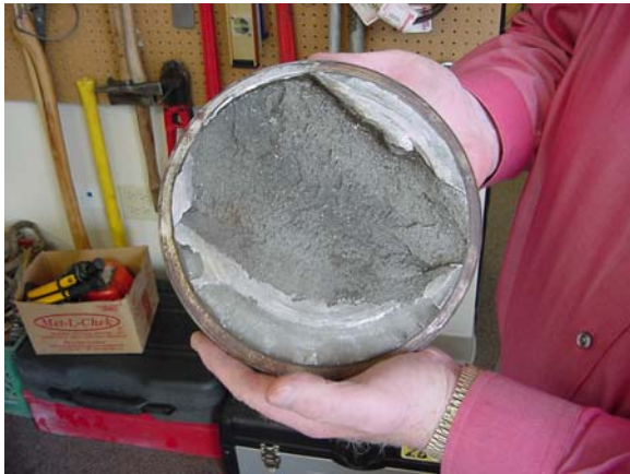
Figure 3. Fatigue Failure of a Large Shaft

In addition to repair NDT procedures, all persons who may be possibly exposed to any repair operation hazards and start-up conditions should be informed and trained about the hazards associated with welding operations and pressure vessel welded repairs. Failure to do so may result in an unnecessary increase in exposure to hazards addressed in the MIP. The fundamental purpose of the MIP is to provide information, which if followed, alters human behavior in such as way that exposure to a hazard is eliminated or minimized.